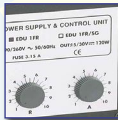
SOFT START AND SPEED REGULATION