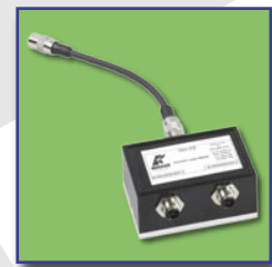
DOUBLE OUTPUT DEVICE WITH CABLE