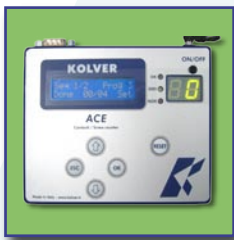
ACE SCREW COUNTER

The EDU1FR/SG controller features additional circuits wired to one connector in the back panel: output 24V for torque reached and lever signals; input start and reverse contacts. A double output connector (DOCK01) is also available for operators using two screwdrivers on the same working area (only FAB and RAF series). One end of this device is to be connected to the controller (cable included), the other end to the drivers. The screwdrivers are not to be used at the same time.